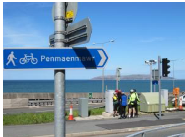
Puffin Island in the background