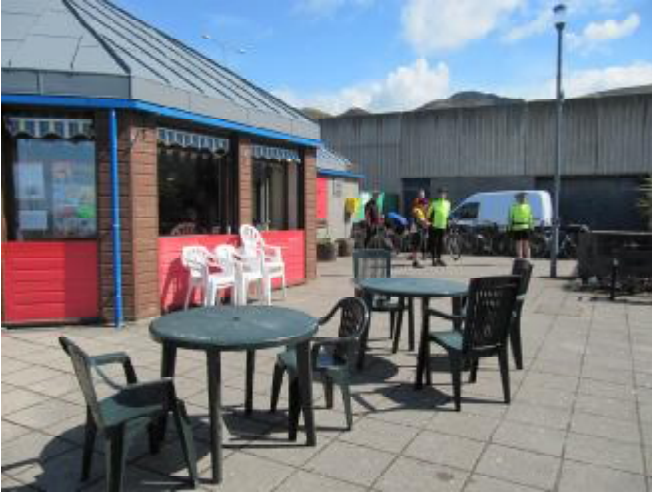
Lunch stop in Penmaenmawr