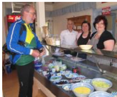
What to have?