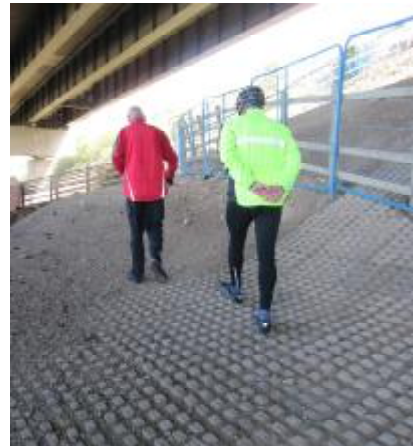
Walking up to see the Pen-y-Clip foot bridge

We rode a bit further on to see the new Pen-y-Clip Bridge to take a couple more photos. First we had to climb up to the main road which Jim described as a dogs' toilet – and he wasn't kidding. All the dogs in Penmaenmawr must have been there at some time for 'walkies'.