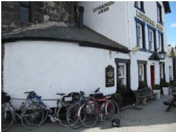
Parked up for 11ses

Part of the cycleway was closed due to a high tide but Alan M guided us up a path, under a bridge, back down to the cycleway and on to the Conway Marina for 11ses. By that time we were well off schedule and desperate for a drink. No...we didn't go into the pub but a café round the corner in the main street. Near the pub a lady in Welsh costume stood patiently outside the door of the 'Smallest House in Wales' waiting for customers to visit the house, and trying to look busy with her souvenirs.