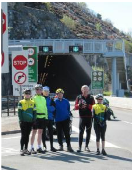
Pen-y-Clip Tunnel and new footbridge